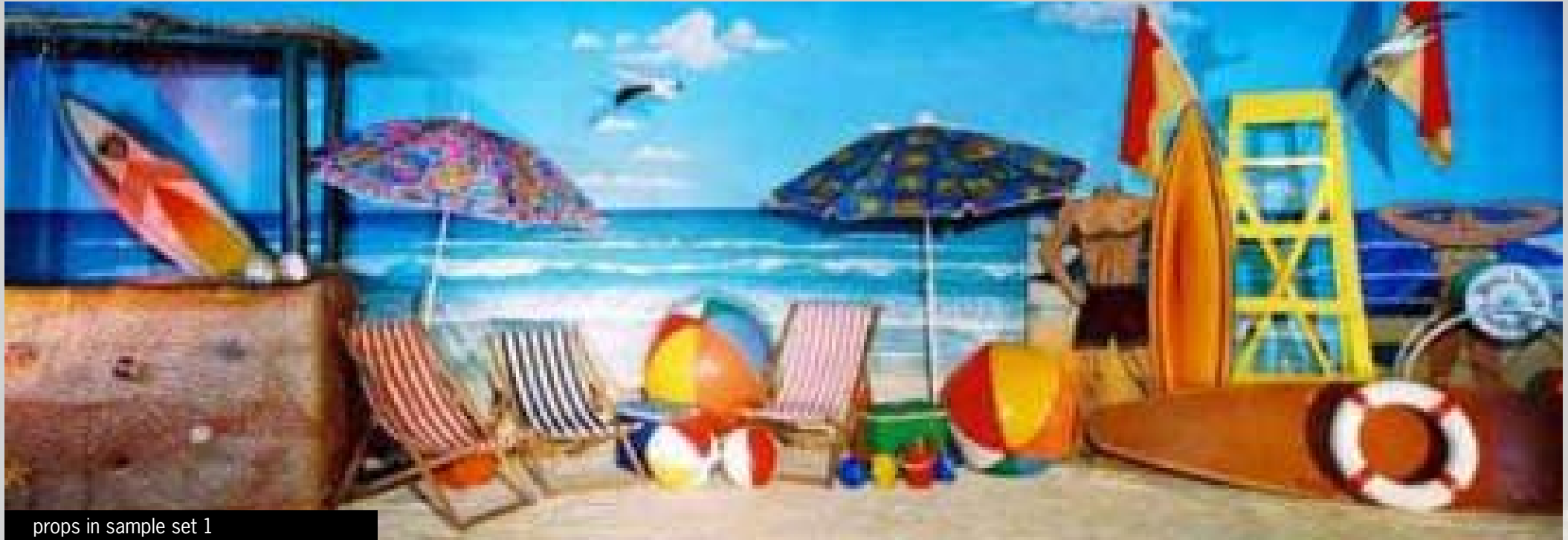
props in sample set 1