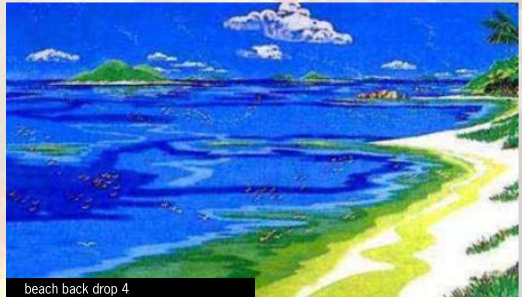
beach back drop 4