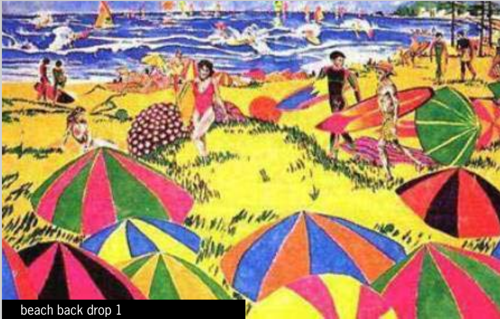
beach back drop 1