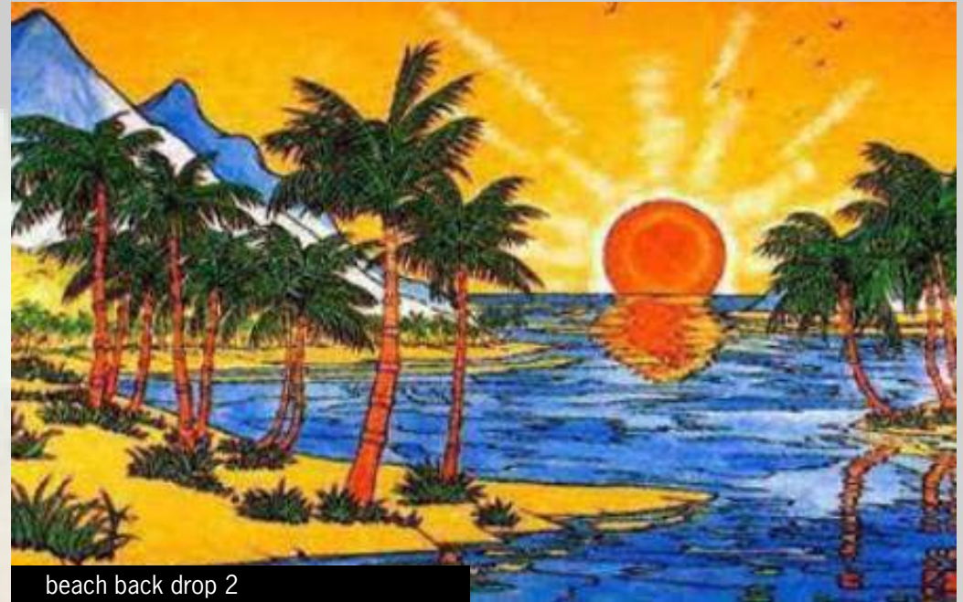
beach back drop 2