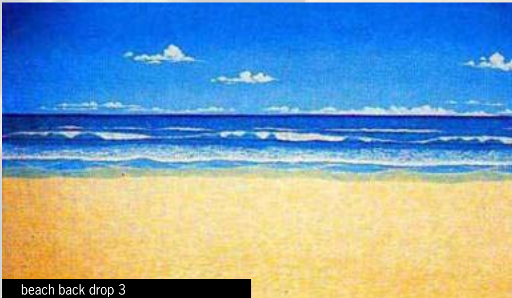
beach back drop 3