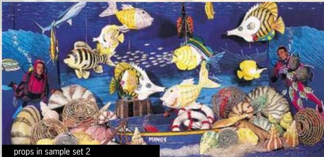
props in sample set 2