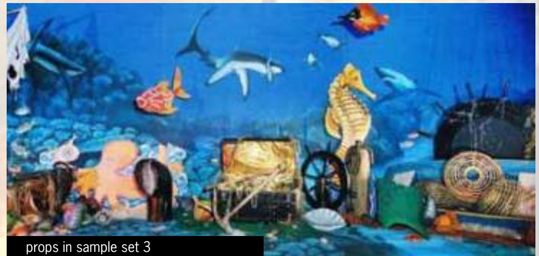
props in sample set 3